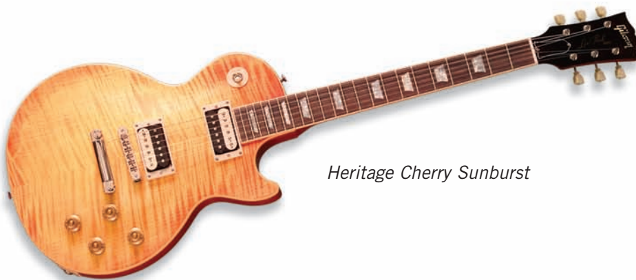
Heritage Cherry Sunburst